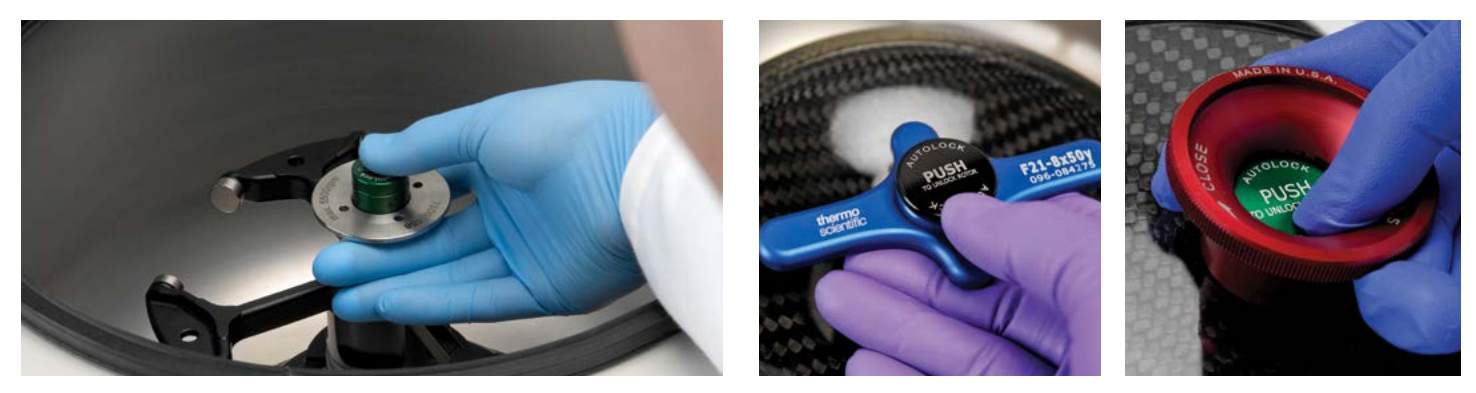
Auto-Lock rotor exchange is identified on Thermo Scientific superspeed centrifuges with a black push button and on Thermo Scientific general purpose and small benchtop centrifuges with a green push button.

Rotors featuring Auto-Lock technology are not interchangeable between platforms.